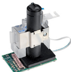
HP Optical Media Advance Sensor (OMAS)

HP Double Swath Technology provides breakthrough speed and performance. The HP DesignJet Z6600 Production Printer includes two sets of three HP 771 and HP 773 DesignJet Printheads, creating a wide print swath—up to 1.67 inches/42.5 mm—and a high firing frequency to deliver prints with amazing speed. Six bi-color printheads feature 1,056 nozzles per color, 1200 nozzles per inch, and small drop volumes for top photo quality.